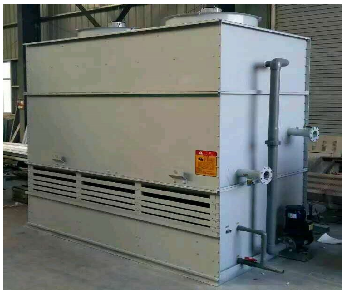
Main configuration parameters of 40T closed cooling tower: